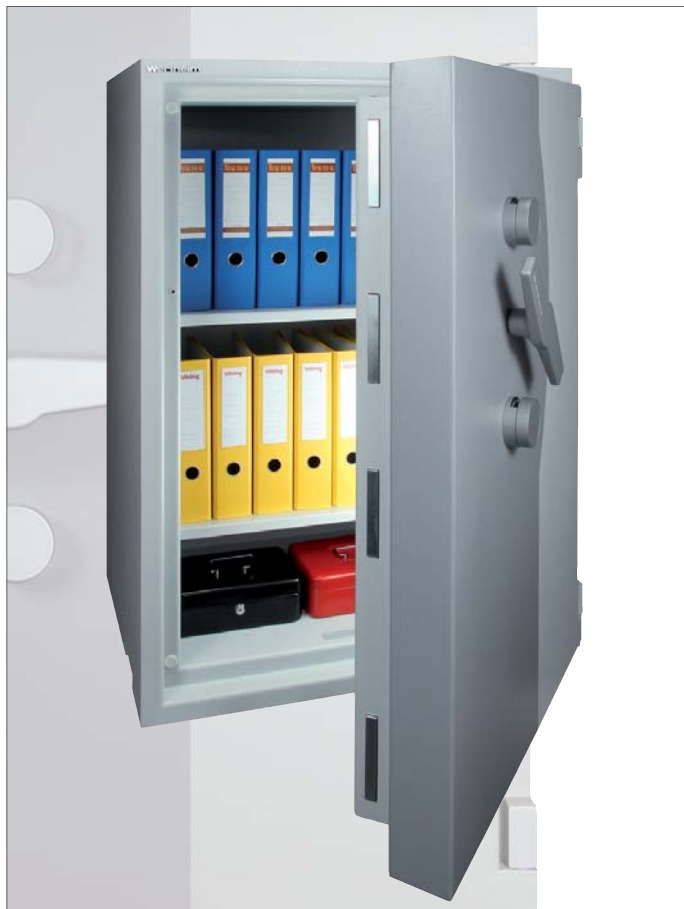
Fig. Safe DWS1200KB, hinge right 2 x N-Lock La Gard 3390VZ (3 wheels), 2 shelves