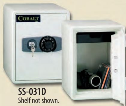
SS-031D Shelf not shown.