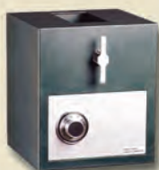
RH1309C RH1612C RH2410C