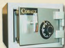
80IN, 150IN, 350IN