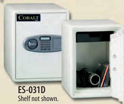
ES-031D Shelf not shown.